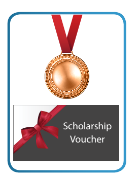
Medals / Scholarship Voucher