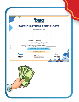
Cash Prizes & Certifications

Fill the consent form at the back of this page.